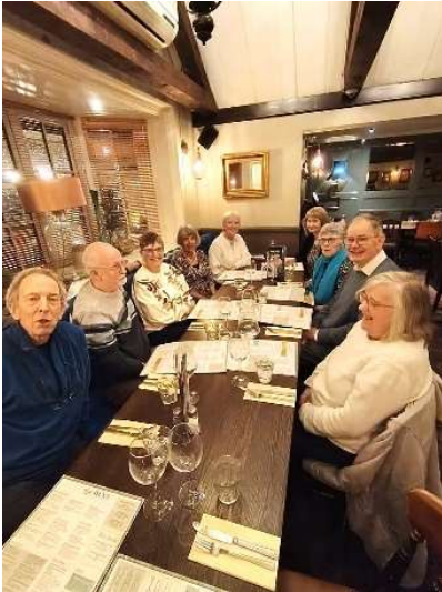
The team enjoying their annual dinner event at the Cricketers in Horsell.